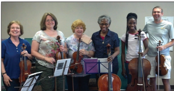
Columbus Scor! Campers this past summer.

For the past few years, you've been hearing that Scor! is a great success. That's because it is--in no small part thanks to your attending, giving, and enthusiastic support. Stories of transformation, confidence, courage, discovery, improvement, camaraderie, and