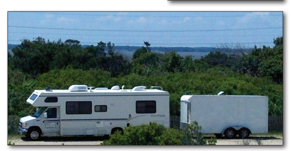
Scor! On Tour--5 months last year! The Bultmans' motorhome (at left) pulling the Scor!-mobile cargo trailer (interior not-yet-built).

Register for Rochester Scor! Camp at the early-bird price, and save $50 off the full price. Only through January 10! see www.StringCamp.com